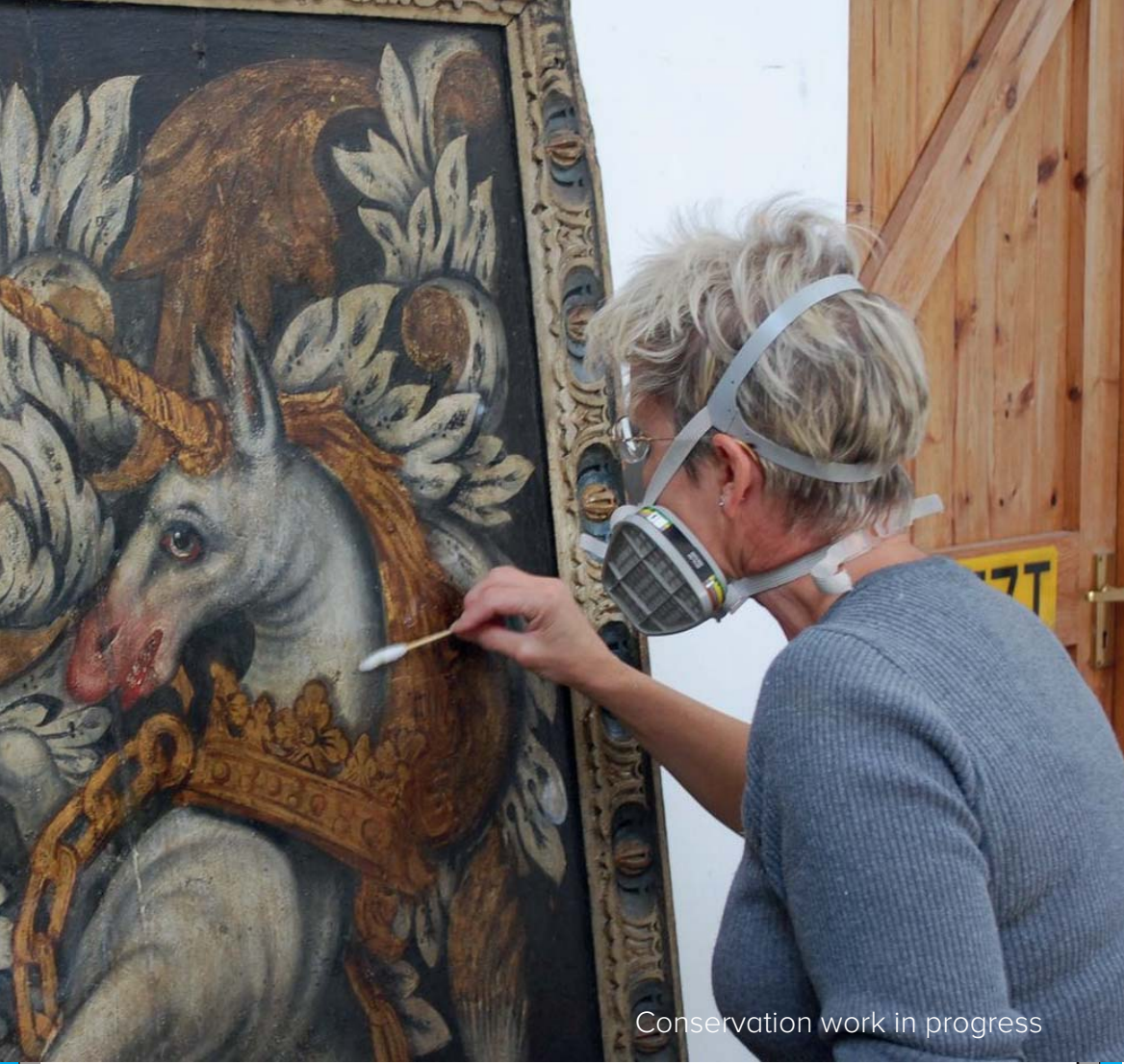
Conservation work in progress