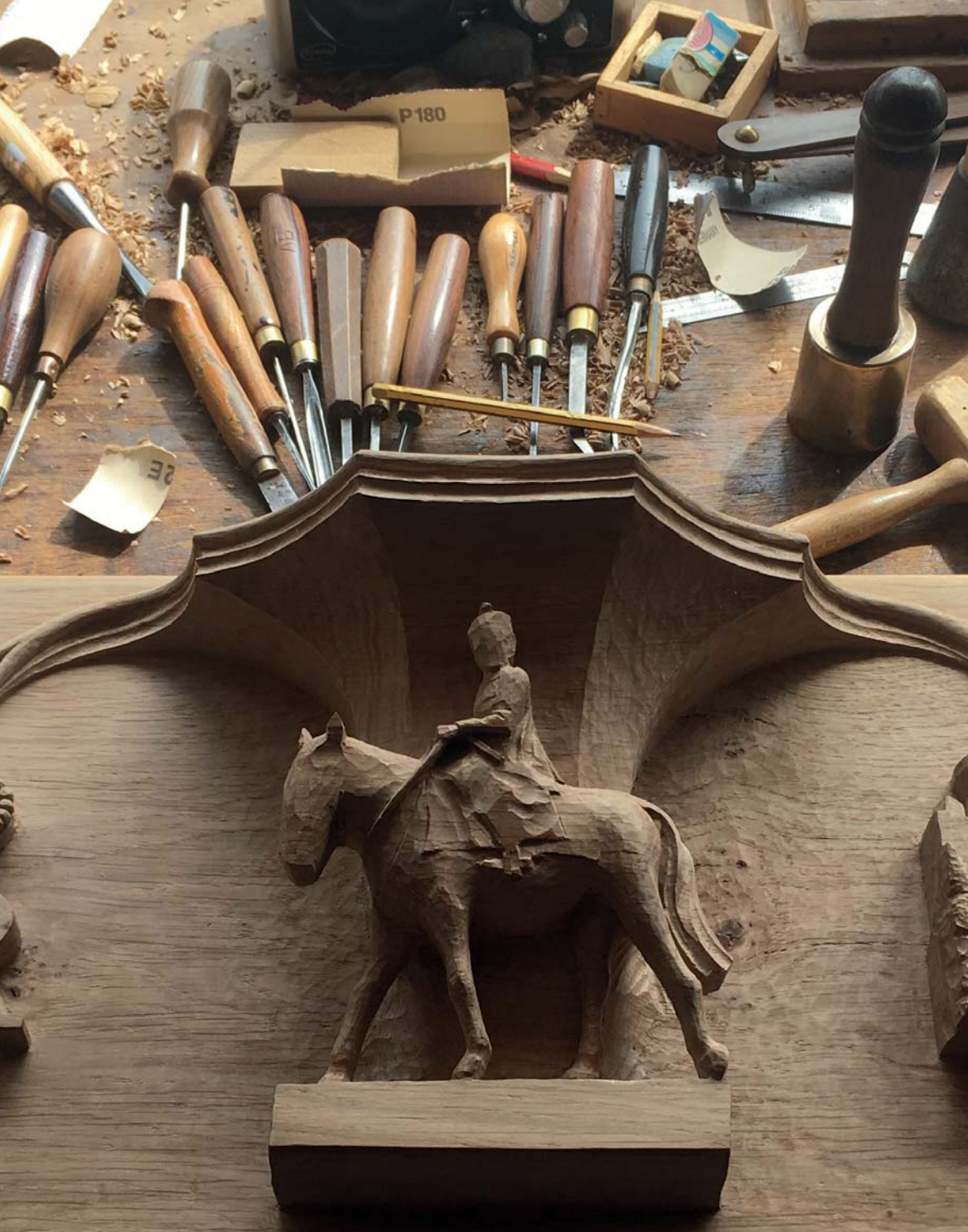
Celebrating the 90th birthday of HM Queen Elizabeth II